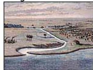
CHICAGO HISTORICAL SOCIETY